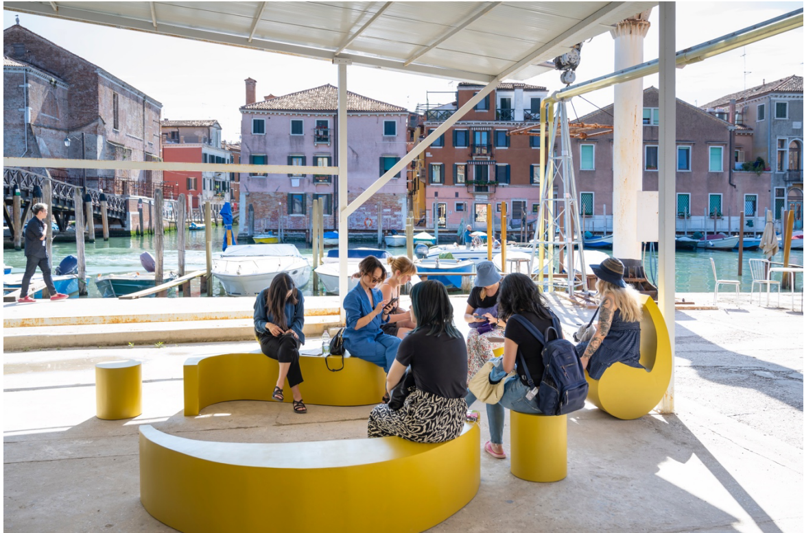
Image Credit: deep dive (pause) uncoiling memory, 2022 Installation Shot Photographer Cristiano Corte, © Alberta Whittle. Courtesy the artist, Scotland+Venice