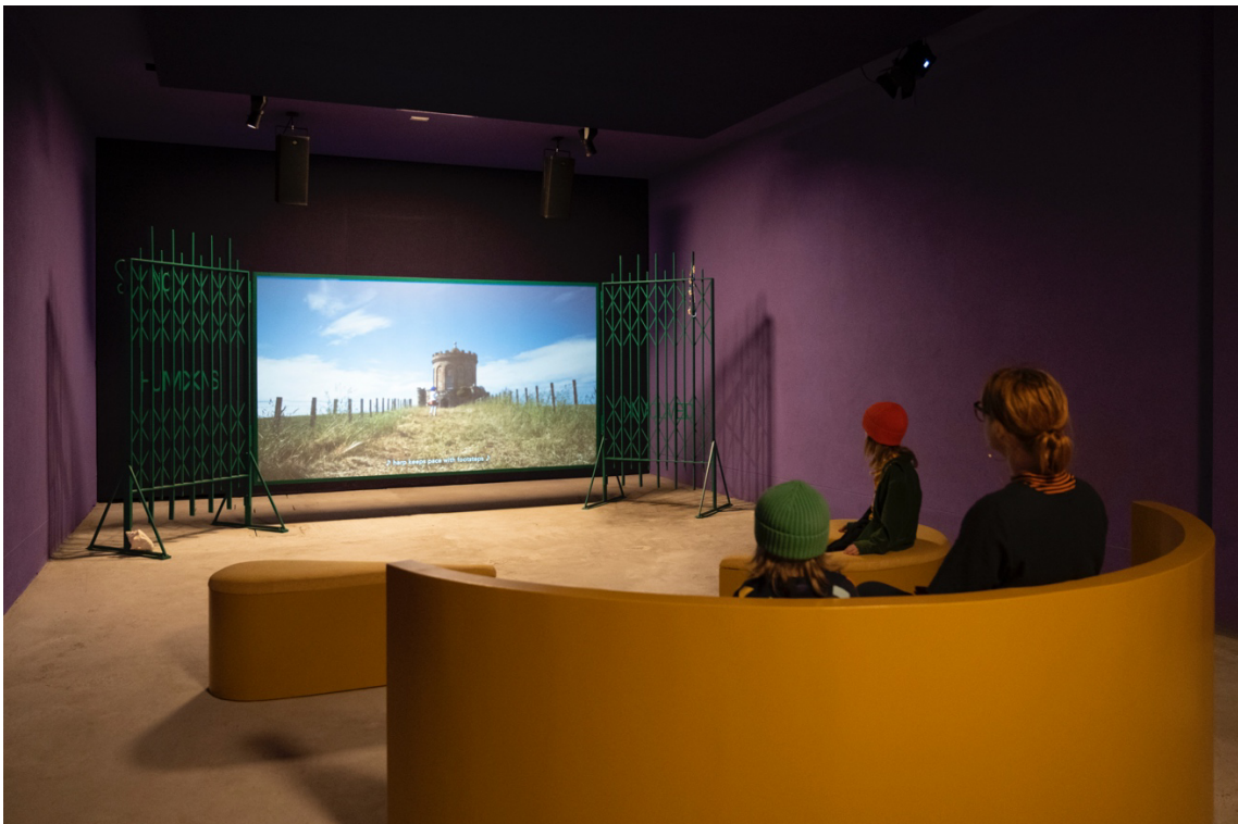
Image Credit: deep dive (pause) uncoiling memory, 2022 Installation Shot Photographer Cristiano Corte, © Alberta Whittle. Courtesy the artist, Scotland+Venice